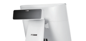
Customer Display • VFD (2 Lines x 20 Characters)