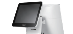
2nd Display • 9.7", 12.1", 15" LCD